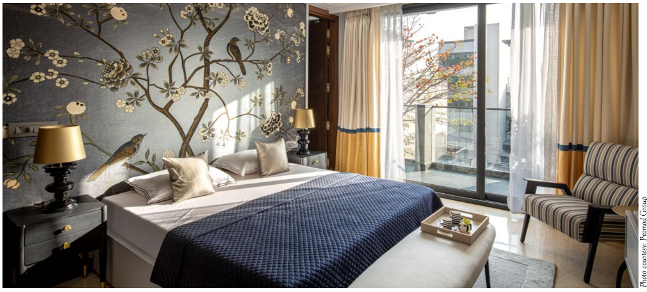
Double glazed Low-E glass can help reduce noise pollution.

vibrations in their tracks. That's where the mechanics of soundproofing come into play with this combination of glass."